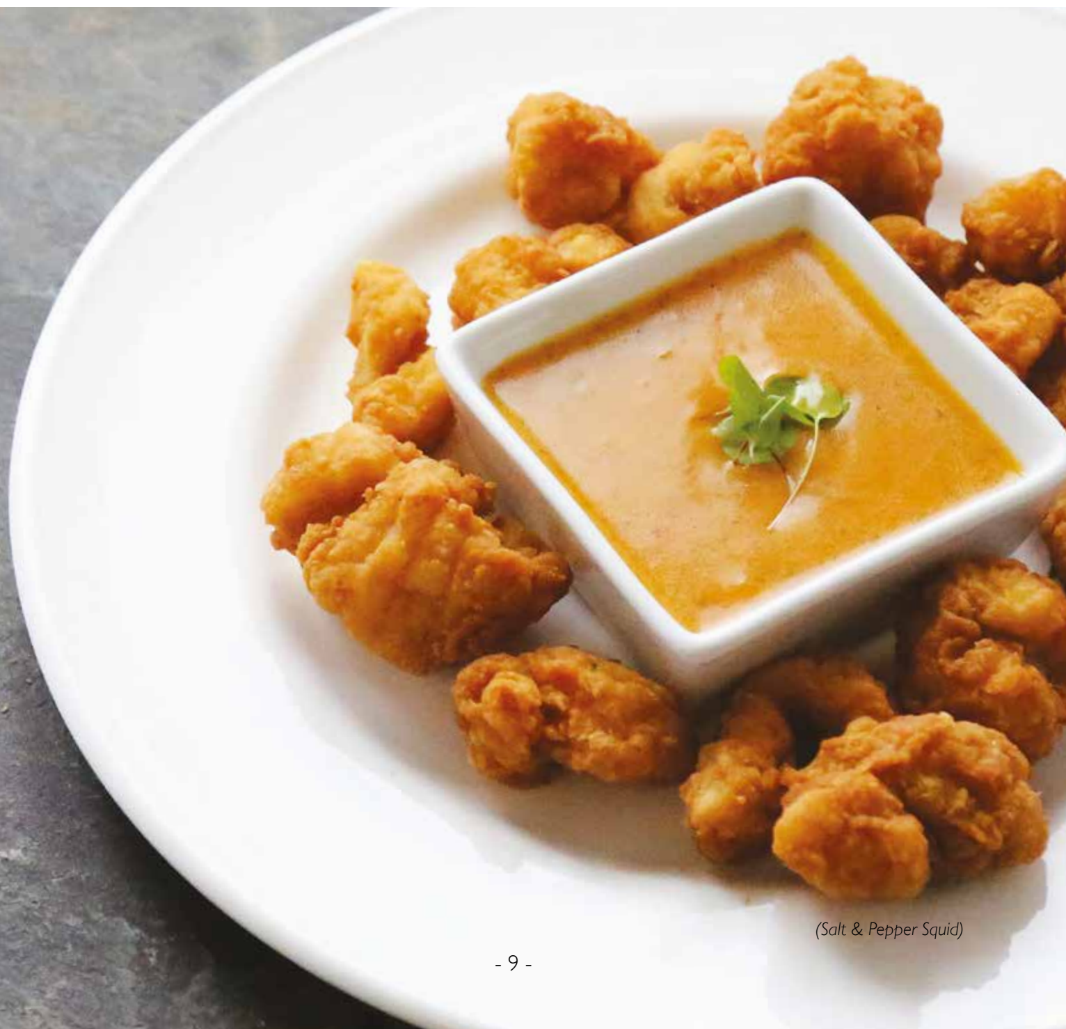
(Salt & Pepper Squid)