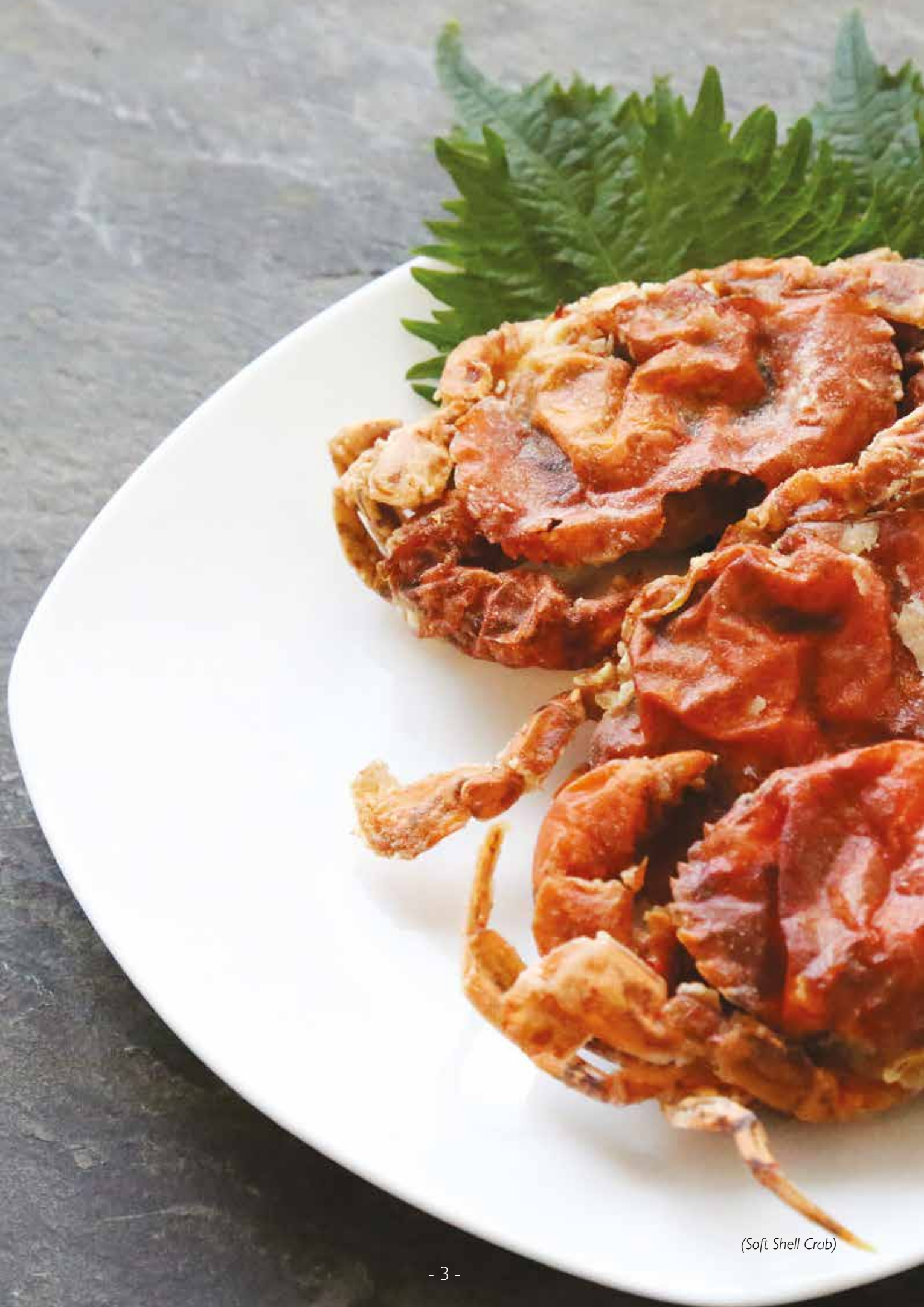
(Soft Shell Crab)