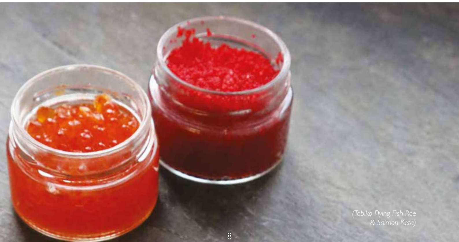
(Tobiko Flying Fish Roe & Salmon Keta)